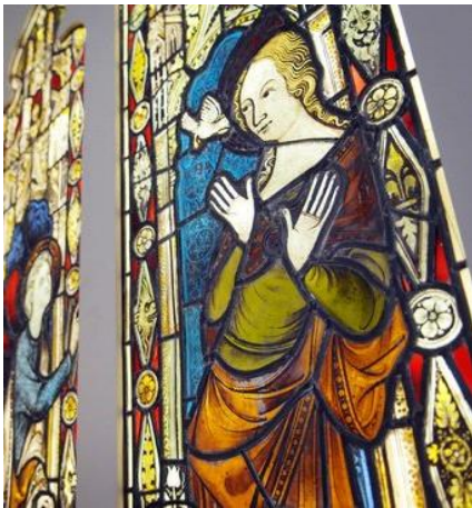
Stained Glass Museum, Ely Cathedral

This Study Holiday offers the opportunity to explore some of the best of Britain's creative culture, as well as developing your language skills. The schedule includes practical workshops in art and craft, and guided visits to galleries and museums. All activities and excursions will be accompanied and directed in English, enabling you to learn and communicate through practical experience.