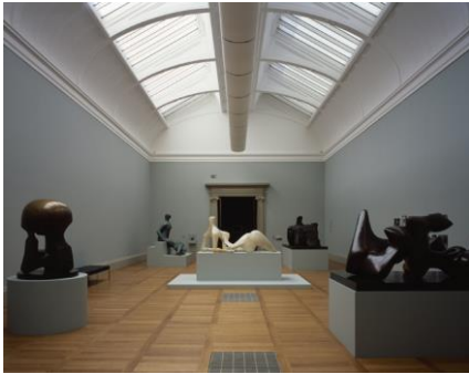
Tate Britain, London