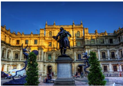
Royal Academy of Arts, London