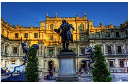
Royal Academy of Arts