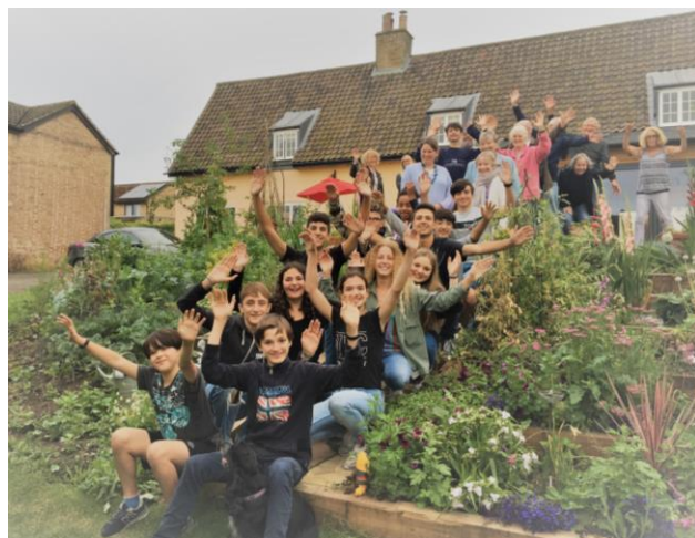
End of course party with hosts and Lyons Languages staff

You may be allowed out with friends in the evenings, but where and for how long must be agreed with your hosts, and you must not go anywhere alone or stay out too late. Ely is a small city and relatively safe, but you must not take risks especially when you are far from home. Always let your host know where you are, and make sure you have their phone number, and that they have yours. While you are staying with them, you must follow the host's rules, behaving politely and appropriately.