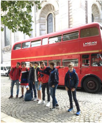
Trip to London