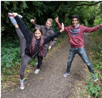
A walk in the countryside