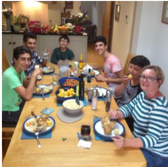
Dinner with hosts and friends